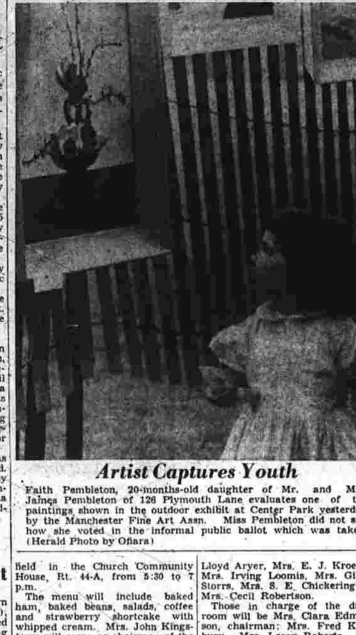
Artist Captures Youth

The result of enthusiastic public response yesterday, the Manchester Fine Art Assn. has decided to make its exhibit at Center Park an annual event.